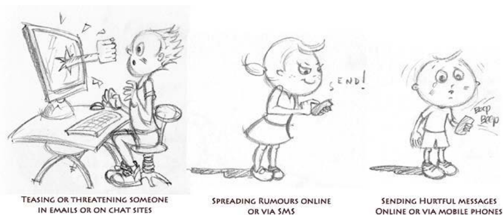
Figure 1 Joint Select Committee on Cyber-Safety 2011 study graphic definitions

In the survey for children aged 13 years and older, cyberbullying was not defined, rather, a series of questions were posed relating to behaviours (pp 551–552):